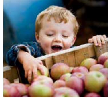
Clockwise from left: Views from Mount Maxwell Provincial Park are tough to top; a trailside fairy door; the island boasts 350 apple varieties; camping with a view at Ruckle Provincial Park