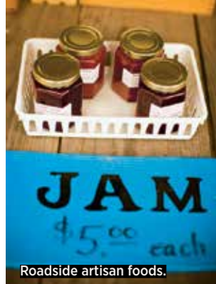
Roadside artisan foods.